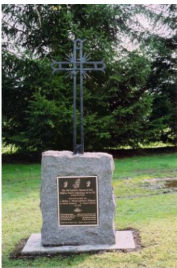
The monument at its location; in front of the monument are several burial plots for the Old Catholic Church of BC