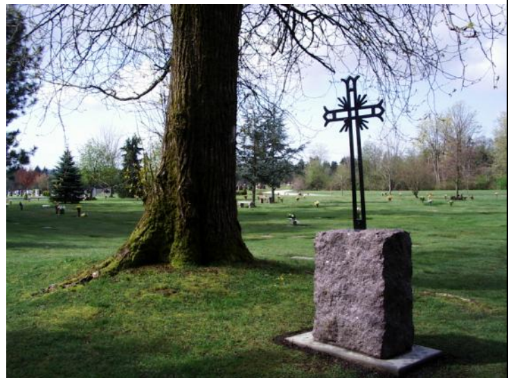
A view from behind the monument