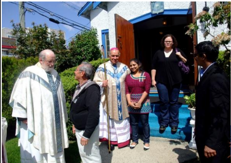
Greeting parishioners after Holy Mass