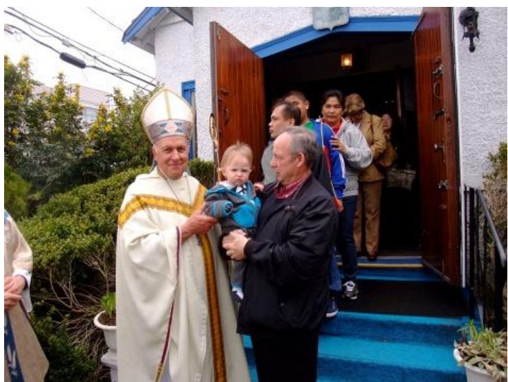
Greeting parishioners after Holy Mass