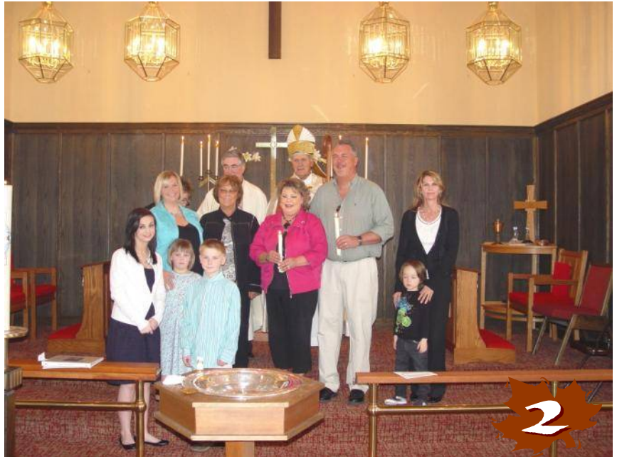
Photo 1 & 2: after the baptism and confirmation with husband, daughter, and grandchildren