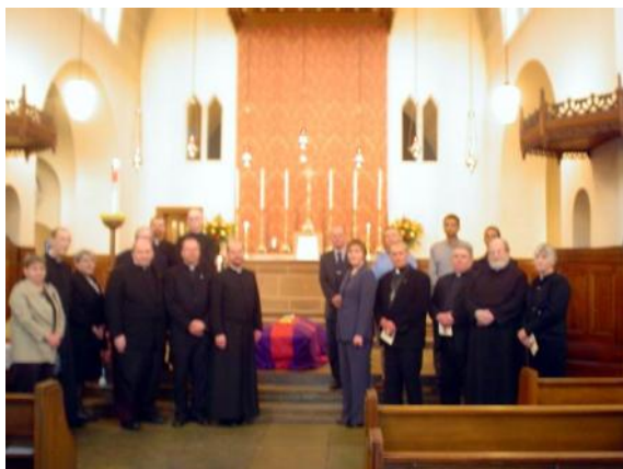
At the Prayer Service on Friday 11 th May 2007, clergy and members pose for a last picture.