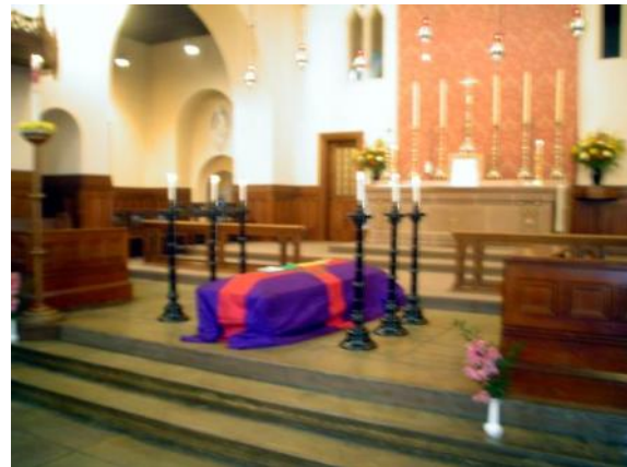
Following Bishop Mack's wishes the casket was placed on the ground