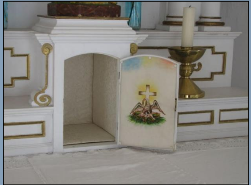
Above left: the Altar in the Processional Chapel of Ile d'Orléans. top right picture: The open door of the tabernacle