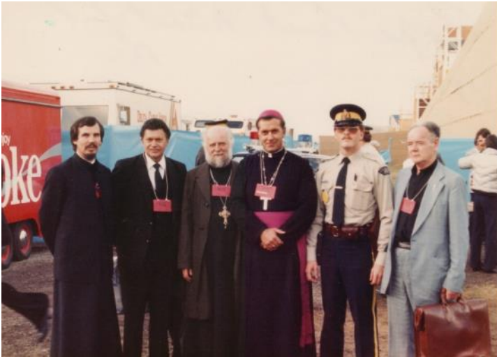
At the visit of Pope John Paul II, 1984 in Abbotsford, BC,