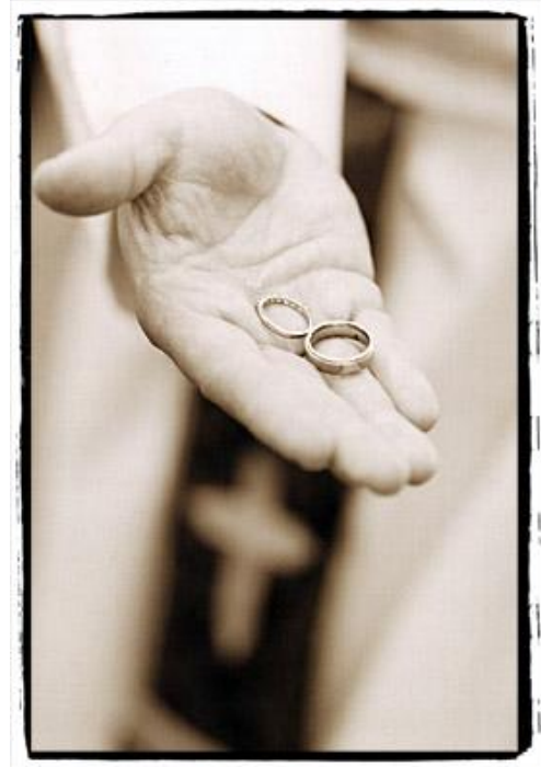
9 July 2004—The Tangredi wedding bands