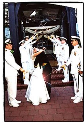
9 July 2004 —The traditional Guard of fellow aviators of the US Navy.