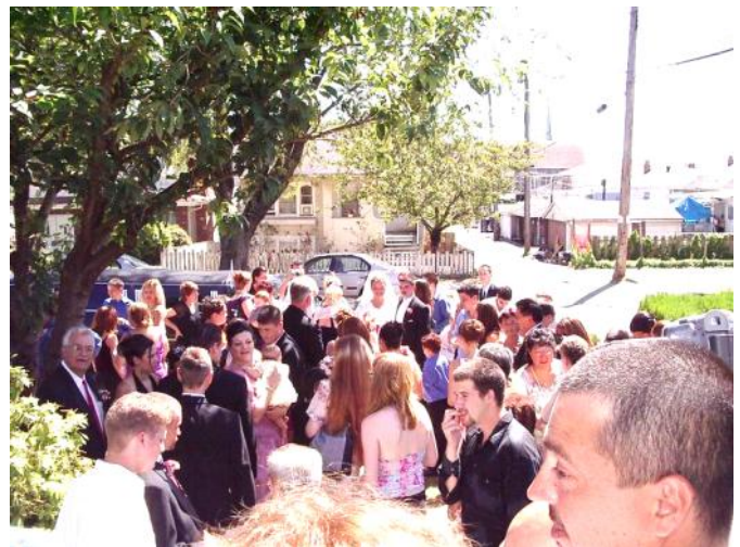
31 July 2004 —After the wedding outside, greeting guests and friends