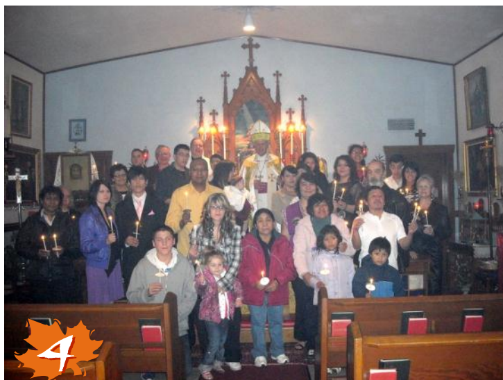
Photo 4 & 5: Members of the Church pose with clergy and the newly baptized