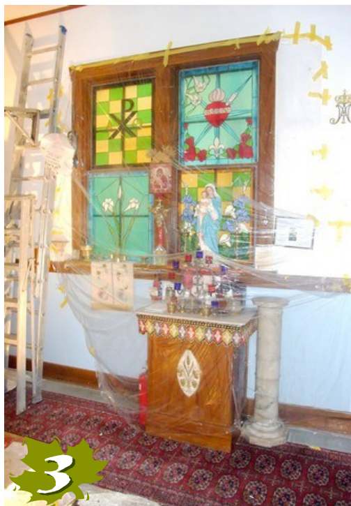
Photo 1: Mr. Steinbach starting to paint the first coat. Photo 2: The Altar and all its appointments had to be moved and most of the sanctuary had to be covered. Photo 3: The stained glass windows were all covered in plastic. Photo 4: Mr. Steinbach teaches Fr. Jürgen how to do the prep work.