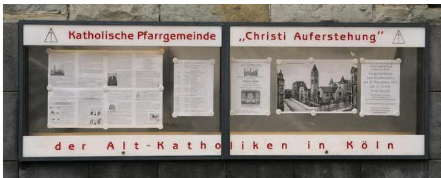
Information board outside the Church