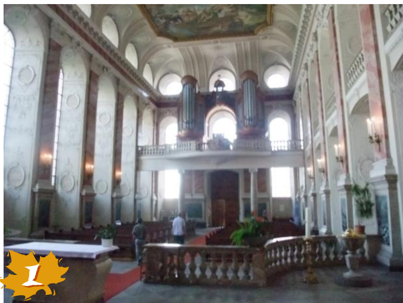
Photo 1: The Church was the official chapel for the Count of Palatine, and Wolfgang A. Mozart played the organ here according to his own accord.