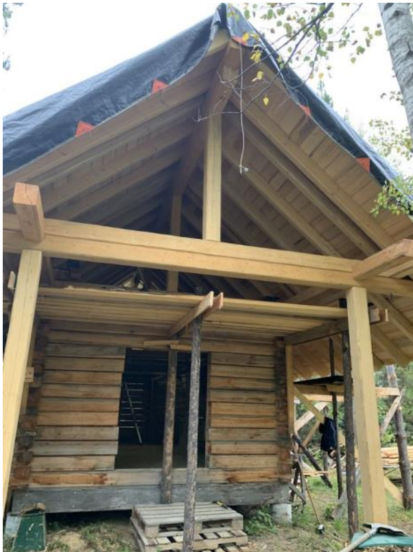
Front Exterior Construction of the Old Catholic Chapel (St. Hubert)