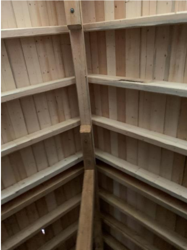
Roof of the Old Catholic Chapel (St. Hubert)