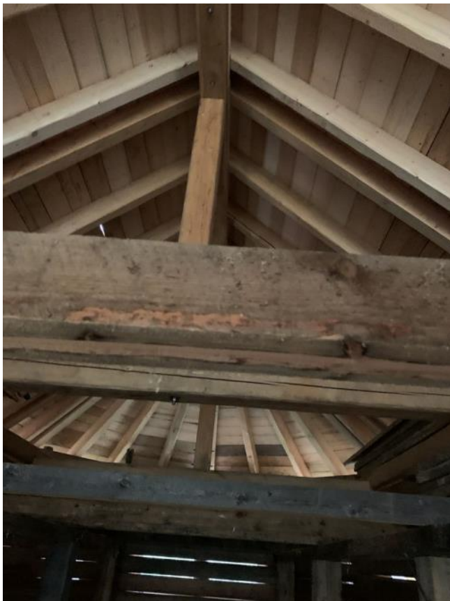
Interior construction of the Old Catholic Chapel (St. Hubert)