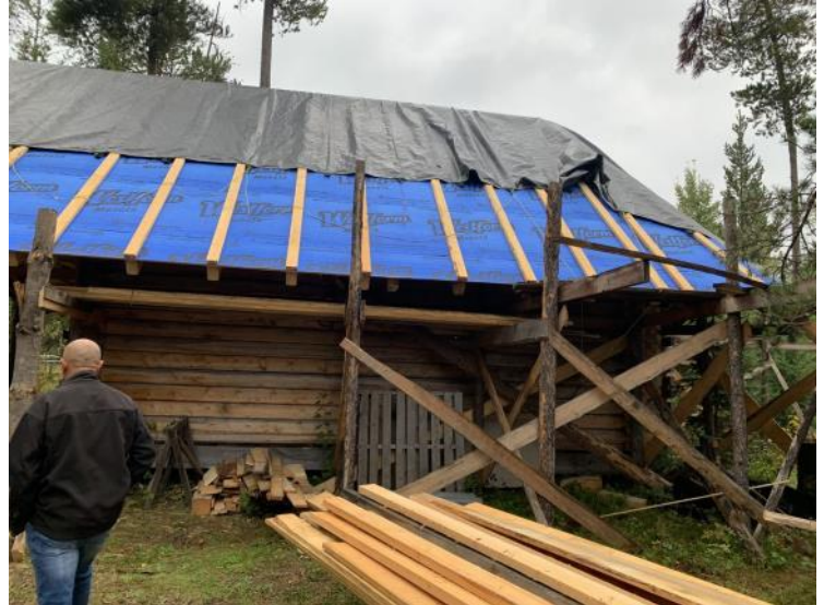
Exterior construction of the Old Catholic Chapel (St. Hubert)