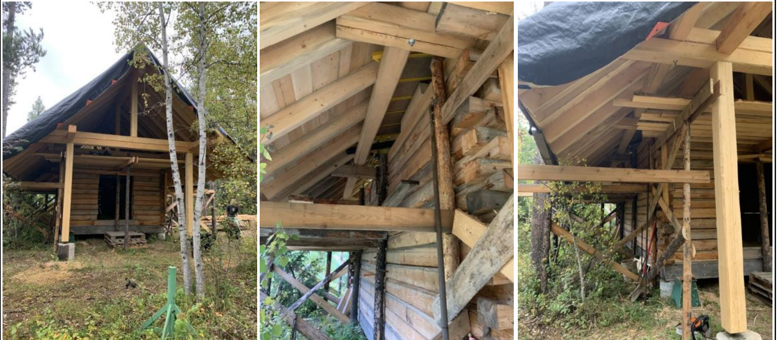
Front Exterior Construction of the Old Catholic Chapel (St. Hubert)