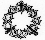
8. CROWN OF THORNS AND NAILS

Frequently the three nails are used separately as a symbol of the crucifixion.