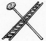
10. LADDER, REED AND SPONGE

A reed and a sponge arranged across a ladder in saltier, may be seen quite frequently as a symbol of the crucifixion.